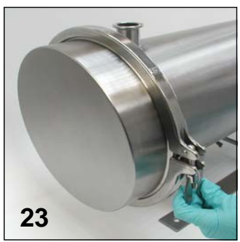
EMCEL Filters Ltd