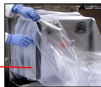
Please note cam bars shown